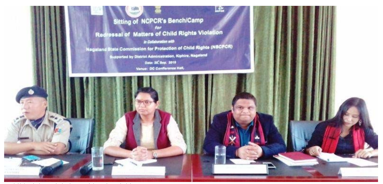
Child Rights Violation evident in Kiphire