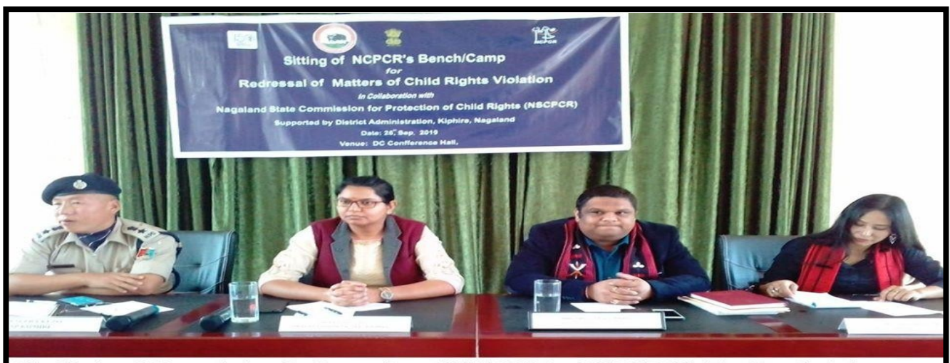
The National Commission for Protection of Child Rights NCPCR Kiphire Bench sitting was held on 26th September 2019.